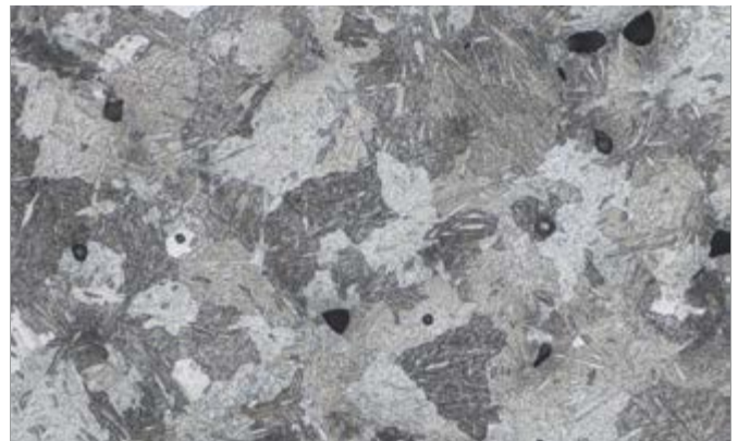
Sintered and annealed