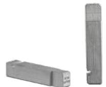
D2 Tool Steel