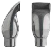
17-4PH Stainless Steel