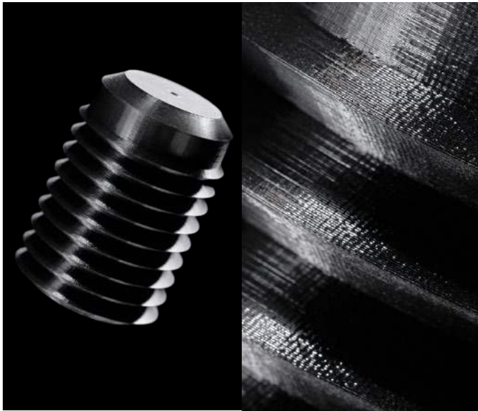
S-TPU in Black